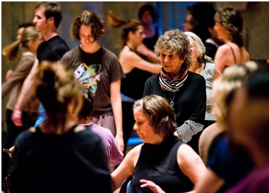
Anna Halprin

Movement Research's programs are served by an infrastructure that is ready to adapt and respond to artists' needs; a dynamic, interactive home base for experimentation and the development of new work; a creative community hub for critical dialogue; and a launch point for artist-driven initiatives. We invite artist participation throughout the organization, helping to build leadership in dance and culture, and ensuring that Movement Research maintains an ongoing connection with the perspectives of artists.