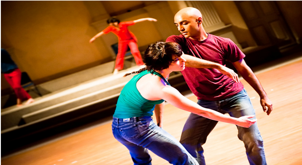
Fall Festival 2009 by Ian Douglas